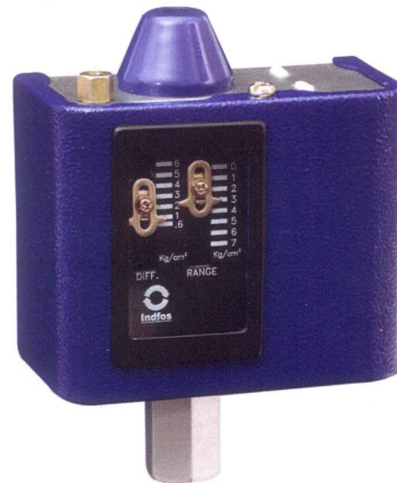
Pressure switch mechanical, model PSM-520