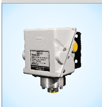
GM – 204