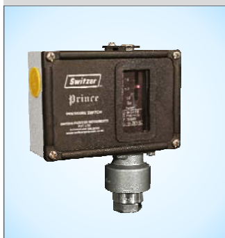
GH – 921