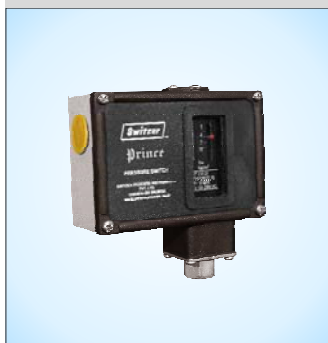
GH – 901 / 902 / 903