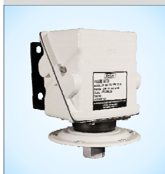
GM – 021